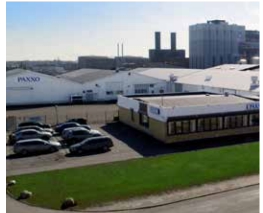
Paxxo was founded in 1980 based on making continuous liners.

We offer the Longopac for Dust in several different strengths and three different formats: Maxi, Midi and Mini. We also offer with guaranteed levels of anti-stat for ATEX environments.